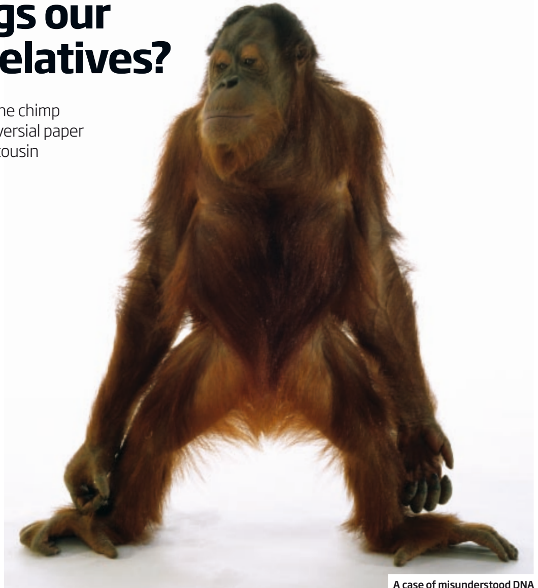
A case of misunderstood DNA

Others were less dismissive, though, agreeing that at least some of the ideas were worth discussing, if only to confirm the overwhelming evidence in favour