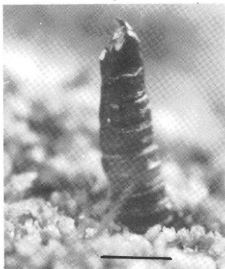
Fig. 9. Pupal exuvia protruding from moss surface Scale line = 10 mm.

at the bog margin feeding damage has been seen on the grass Poa colensoi . Host plants of C. minos include S. cristatum and probably a similar range of mosses to species 1.